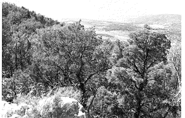
The view the other side of Smoke-Oh Lookout along Arden Vale to Wilpena Pound on the horizon.

There's a colour photo on the back page of this Mercury of the Wattle Grove in flower, just to the west of the cairned saddle. ■